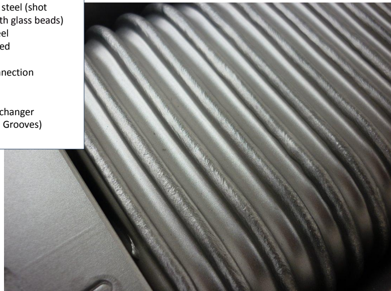
Detail of precise welds of plate-packet